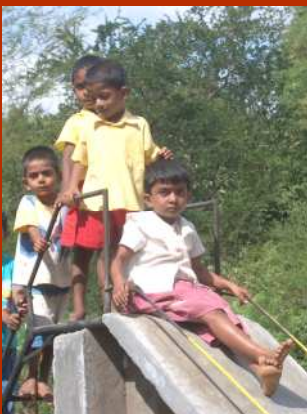
Children enjoy a playground in a Shining Life pre-school .

“Earlier there was no place for us to play . Now we have our own playground of our own.... I look forward to playing netball and elle “ (a traditional Sri Lankan game.)